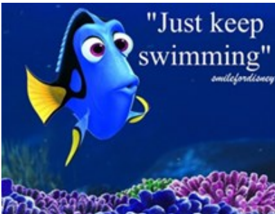
Learn to persevere when faced with a struggle!

I expect you to participate in class by: being actively ENGAGED, CONNECTING with ALL students in the class, CHALLENGING yourself, and INSPIRING those around you. Geometry can be a struggle, but investing hard work will pay off! This class will feel different from Algebra, but will need you to incorporate what you learned last year!